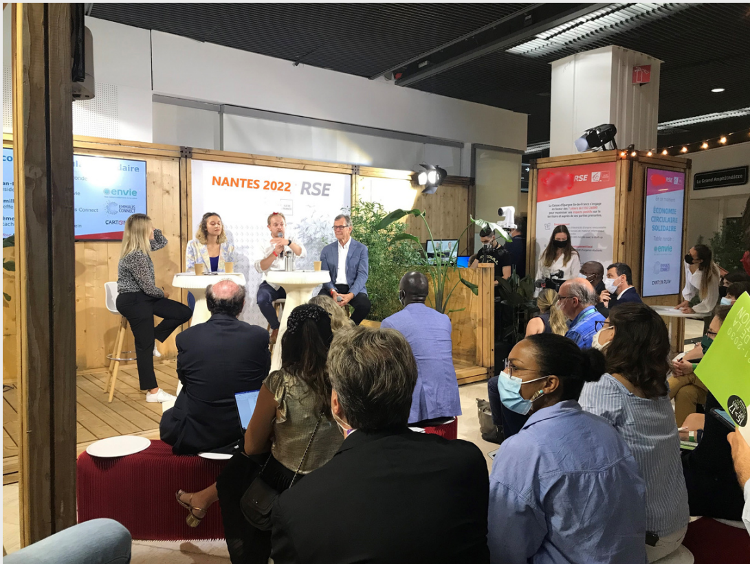
Meetings on the agora