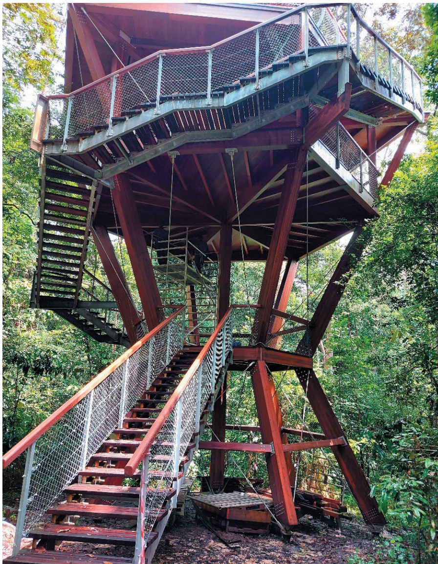
Treetop classroom made of padouk, Raponda Walker Arboretum, Cap Estérias, Gabon Ecwood production

https://www.gabonreview.com/arc-demeraude-une-salle-de-classe-perchee-dans-les-arbres-a-larboretum-raponda-walker/