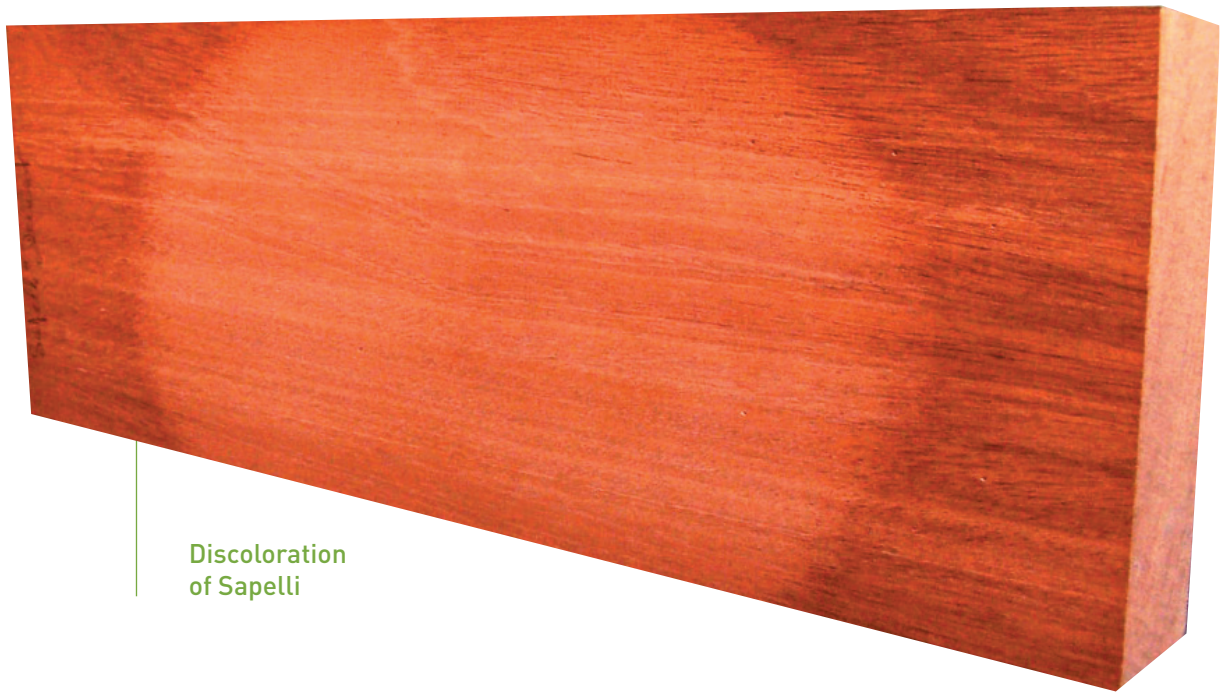
Discoloration of Sapelli