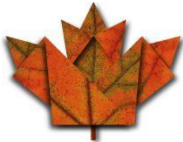
FSC® General Assembly 2017 Vancouver, Canada, 8–13 October